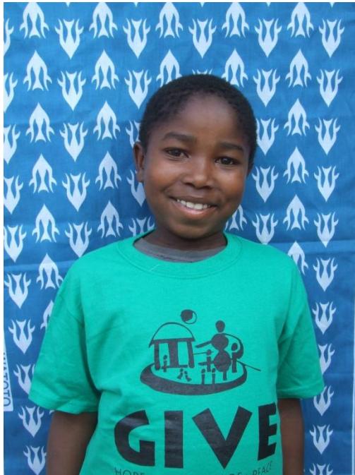
Photo (L) taken August 2012 after receiving new clothes, shoes and a school backpack.

Email: info@mwangazafoundation.org Website: www.mwangazafoundation.org